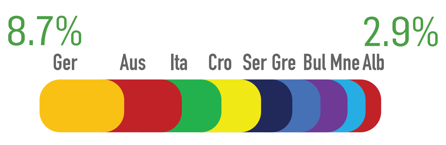
Shares of GDP allocated to Public Health

Switzerland, USA, EU, Global Fund, Kazakhistan