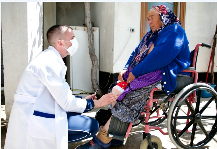
Protecting People

UN Resident Coordinator in Albania Fiona McCluney visited the accommodation units and sanitary services installed at the Kapshtica Border crossing in the framework of the EU funded project “Addressing COVID-19 Challenges within the Migrant and Refugee Response in the Western Balkans. The United Nations through IOM and UNHCR are working to ensure that the rights of migrants, asylum-seekers and refugees are protected, and that migration and asylum management systems remain operational.