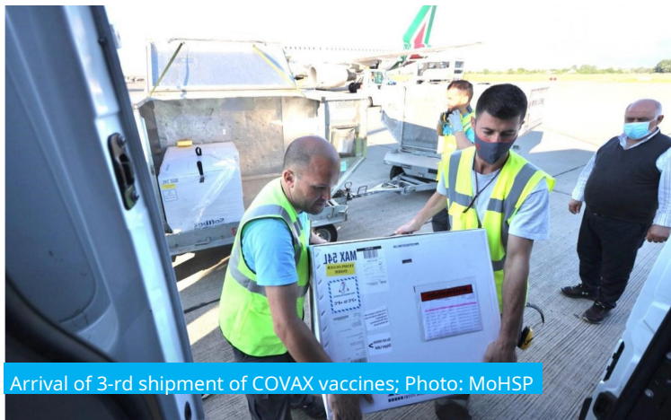
Arrival of 3-rd shipment of COVAX vaccines

Latest news: A third shipment of 40,800 doses of Astra Zeneca COVID-19 vaccine arrived at Mother Teresa Airport, Tirana, as the final batch of a total of 120,000 doses that Albania signed up to receive through the COVAX mechanism .