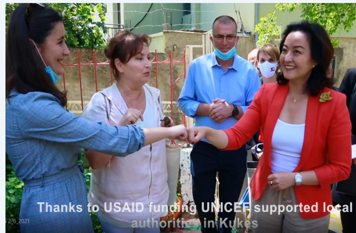
Thanks to USAID funding UNICEF supported local authorities in Kukës US Ambassador and UNICEF Representative visiting kindergarten nr 1 in Kukes.

Personal hygiene kits were delivered to vulnerable families and children in Kukes, to ensure critical hygiene supplies were available to support implementation of key hygiene practices at family and community level in the context of COVID-19.