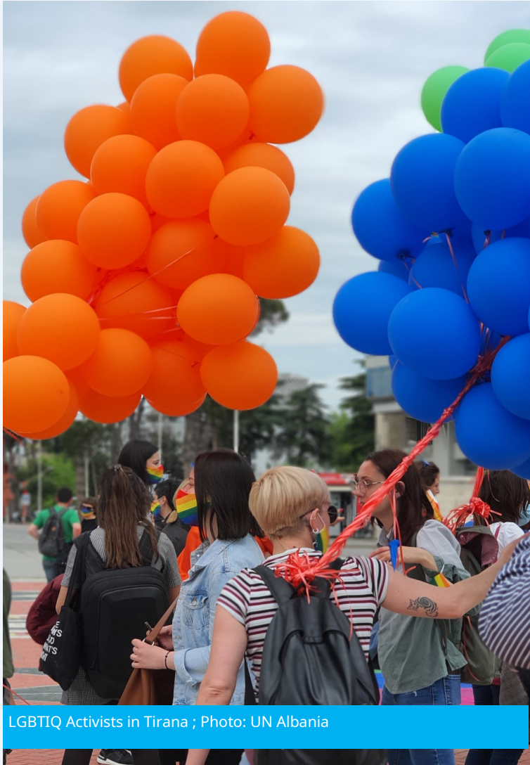
LGBTIQ Activists in Tirana

The Food and Agriculture Organization of the United Nations (FAO) continues to run a series of regional COVID-19 webinars focusing on Europe and Central Asia. The last webinar addressed linkages in terms of COVID-19 response and digitalization, presented an array of digital-technology solutions applied in agriculture, their inter-connectivity and potential benefits, and the factors hampering their implementation during the pandemic. Access and register to FAO Webinars here .