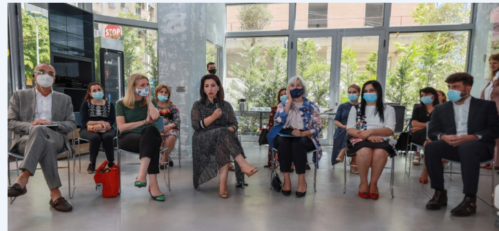
UN Resident Coordinator with Minister of Education, Ambassador of Netherlands in Albania, UNICEF Representative meet with Akademia.al

UNICEF Albania continues to support and assist the public-school system for blended learning during COVID-19 and beyond. Providing thousands of free video lessons and the most advanced learning management system platform for online learning for the Albanian public-school system”; a project supported by UNICEF and MOESY through the financial support of the Netherlands Government through the SDG Acceleration Fund and implemented by Akademi.al.