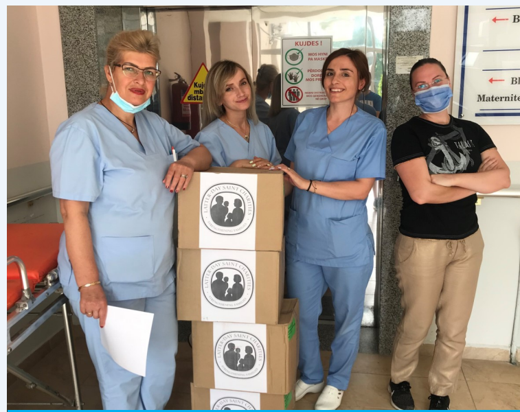
Delivering aid to Maternity Hospital Elbasan

Parents play a fundamental role in educating the young generations. In a pandemic situation the role of parents to advising children becomes even more important to help in curbing the infections through application of protection measures. June as a UNICEF's 'Parenting Month' served as an opportunity to rally, with one voice, to scale up support to parents and caregivers to give their children the best start in life. UNICEF Albania were at #Pinoku Kindergarten at Bregu i Lumit in Tirana with mothers in a discussion and awareness raising event talking about the challenges of good parenting in a pandemic.