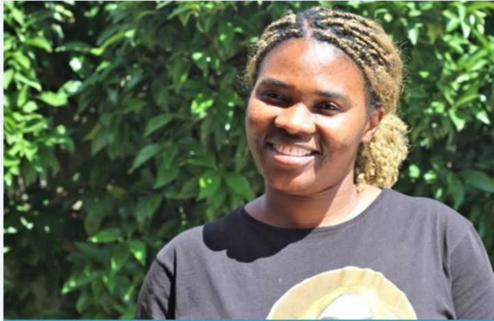
Ms. E.F.M., a refugee from the Democratic Republic of Congo, now living in Albania.

UNHCR Albania continues to work closely with Albanian health authorities to ensure that health care services are available to the refugees and asylum seekers who can access the Health Card, in the public hospitals for any other medical attentions required. Emergency assistance is granted to all independently of access to this card, including those arriving at borders. The Government of Albania has included refugees and asylum seekers within the national vaccination programme with same conditions that apply to the Albanian citizens.