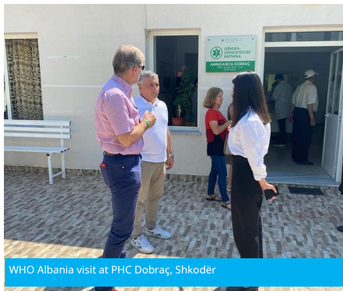
WHO Albania visit at PHC Dobraç, Shkodër

Primary Health Centers are instrumental in the pandemic response, as well as to maintain essential health services. The WHO Country Office in Albania is following closely the vaccination process in the country with a special focus to the role of PHCs. During a visit to a PHC and COVID-19 vaccination site in Dobraç, Shkodër the WHO representatives underlined the leading role that the PHCs should play in epidemiological surveillance and contract tracing.