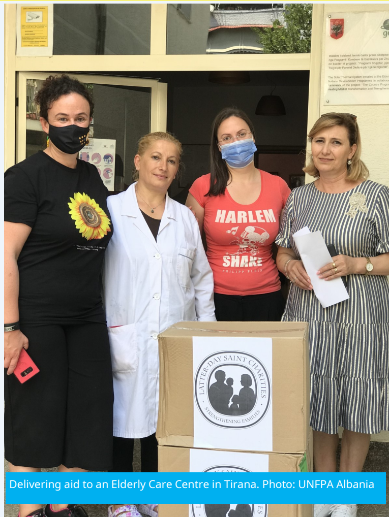
Delivering aid to an Elderly Care Centre in Tirana.

UNICEF Albania and municipality of Durres discuss on how to collaborate together in support of vulnerable young people, families and children especially in the context of Covid-19 pandemic. There is a need to build solutions for young people and strengthening of the capacities for the professionals to work with young people and children. The social care plan that started already with support of UNICEF will establish the foundations for more services.