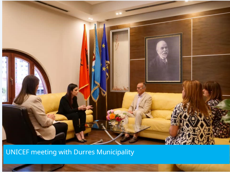
UNICEF meeting with Durres Municipality

Covid-19 consequences have affected the vulnerable groups the most. Following a review of the situation in several maternity hospitals and social care centers, the UNFPA office Albania in collaboration with the Ministry of Health and Social Protection delivered food and sanitary packages to the main maternity hospitals of Albania in 10 districts to the Older People's Home and Children's Home in Tirana. The packages were donated by Later-day Saint Charities of Albania