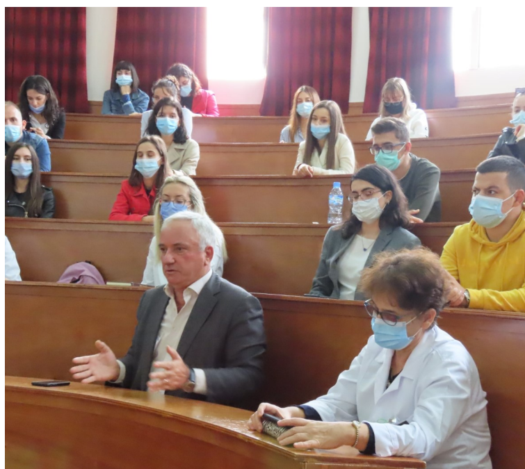
Vaccine Uptake: Townhall with students.