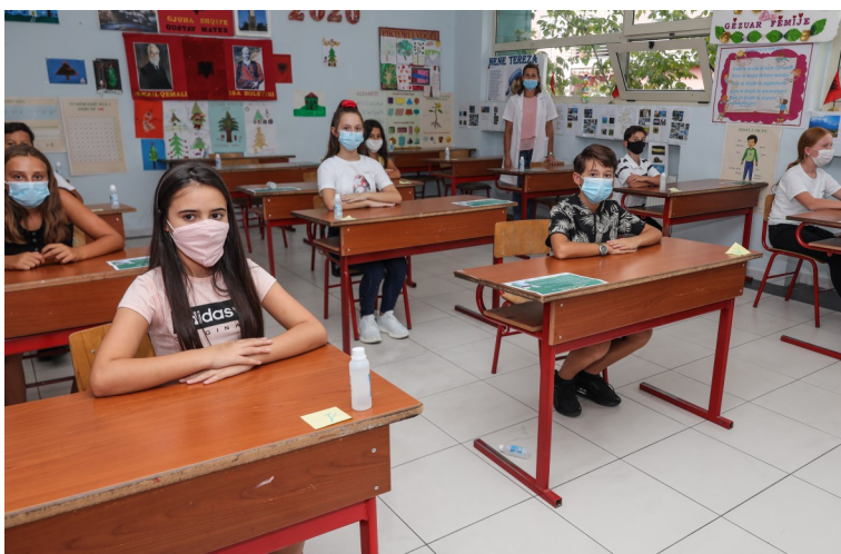
UNICEF's awareness campaign on the child right

Additionally, in partnership with Foundation Together Albania, UNICEF's local partner, 260 children and young people with direct psychosocial and mental health counselling sessions and dedicated helping them to cope with mental health concerns including depression and anxiety. More here