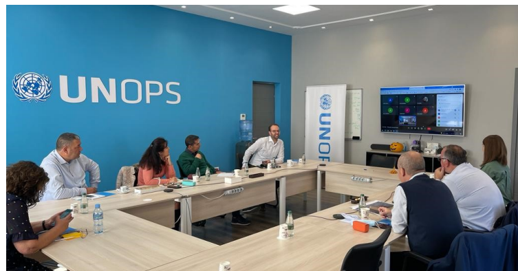
UNOPS presenting IPH concept design. October 2021

As part of COVID-19 emergency response, UNOPS Albania has now developed and presented the concept designs for the modernization of two key health institutions in Albania, namely the Institute of Public Health and the Infectious Disease Clinic of Mother Teresa Hospital. The presentations were delivered to the Minister of Health and Social Protection, the leading medical staff and senior management of both respective organizations. This paves the way for the next phase of detailed design of planned renovation works for these institutions and bring them to international standards of healthcare.