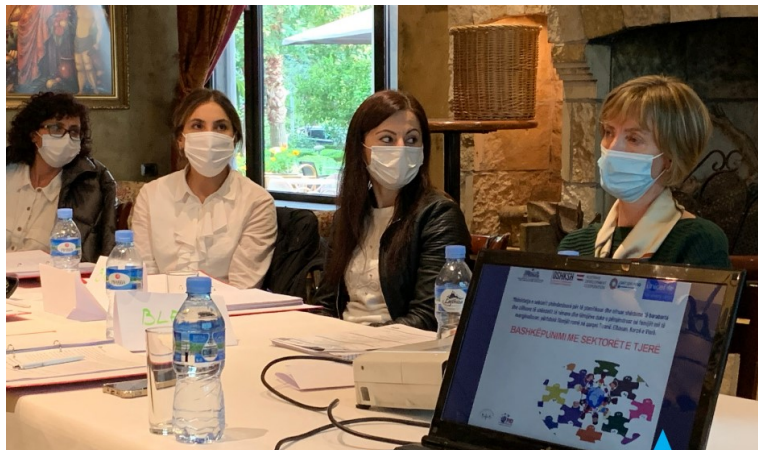
UNICEF Trainings for Health provider (archive).

The on line trainings were accredited by the National Center for Continuous Medical Education, and include elements of standard IPC precautions such as hand hygiene, respiratory hygiene, use of PPE according to risk, safe injection practices, waste management, cleaning and disinfecting in the COVID-19