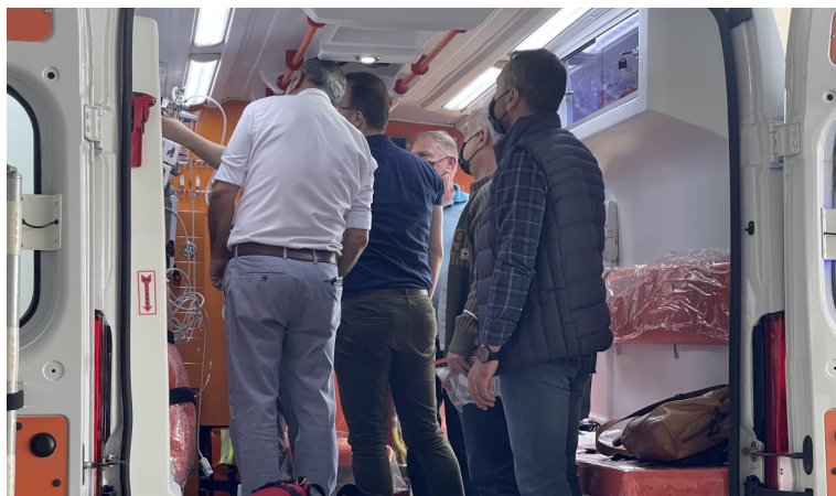
Inspecting the prototype of the new auto-ambulances that will arrive to Albania.

UNOPS Albania and representatives from the National Centre for Management of Emergencies visited the Ambulance Manufacturer in Turkey and inspected the prototype of the new auto-ambulances that will be added to the current fleet, in the frame of the COVID-19 emergency response project. The delivery of 20 new auto-ambulances is expected to be completed in November as planned.