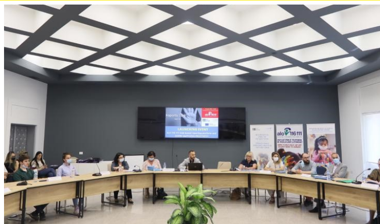
Launching Raporto Tani/Report Now"

Awareness messages and child right information are also being prepared to be launched through TVSH Shkolla. In addition, 300 additional teachers have been trained in blended learning during the reporting period through the cooperation with Ministry of Education, Sports and Youth.