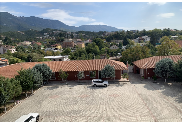
The National Reception Centre for Asylum Seekers in Babrru, Tirana.

UNHCR continued to monitor the health situation of refugees and asylum seekers and provided necessary support and guidance to the families infected by or showing symptoms of COVID-19. Throughout the year, UNHCR partner RMSA continued to deliver PPE to persons of concern and relevant personnel working with refugees, including the staff of National Reception Centre for Asylum Seekers in Babrru, Tirana.