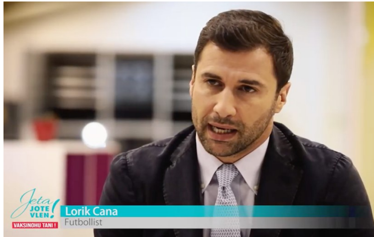
Lorik Cana, Football Player :“Your life counts, get vaccinated”

WHO Albania is providing technical support to the Ministry of Health and Social Protection (MoHSP) in shaping and implementing a communication campaign intending to increase vaccine uptake in Albania the Ministry of Health and Social Protection (MoHSP).