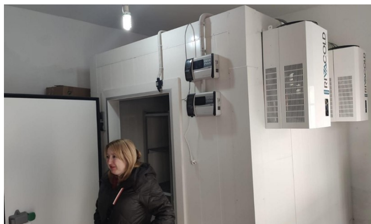
One of the 'cold chain' rooms

Countries both need to secure timely and sufficient supplies of vaccines and a distribution plan. Cold Chain is key when it comes to maintaining and distributing covid-19 vaccines. The cold chain is a set of rules and procedures that ensure the proper storage and distribution of vaccines to health services from the national to the local level. The cold chain is interconnected with refrigeration equipment that allows vaccines to be stored at recommended temperatures to maintain their potency.