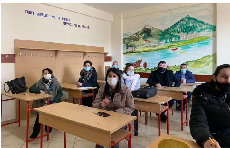
Teachers training in ICT

22 TechHUBS have been set up in compulsory schools affected by the Earthquake, benefiting 8,000 students funded by Government of Netherlands through SDG fund. Schools were provided with 1,840 tablets and 24 smart boards. As part of the TechHUBS initiative, UNICEF and ASCAP have prepared a methodology for teacher training in ICT to provide teachers with the knowledge and skills to use technology as a means to improve children learning outcomes. To date, 2,362 teachers have been trained, while 14,000 others have benefited from peer learning experiences. UNICEF also supported ASCAP to develop the ICT Standards for teachers, currently approved by Ministry of Education and Sports.