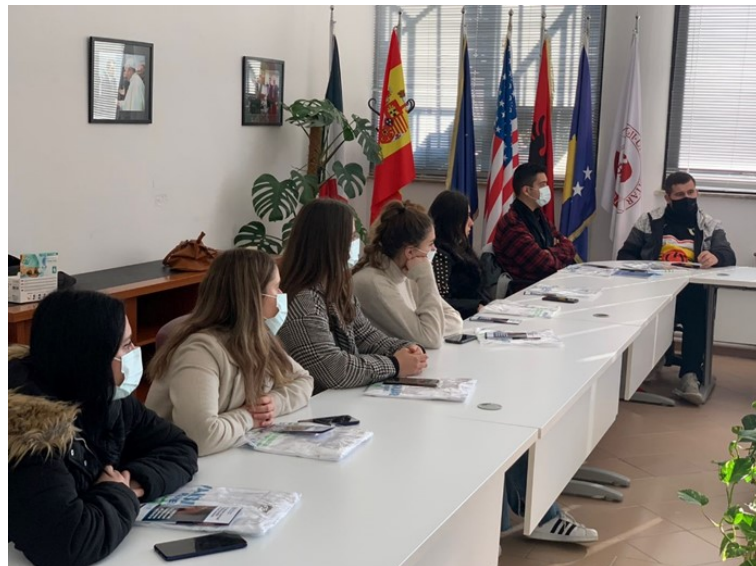
Students' training on responsible journalism

The WHO supported the Association of Health Journalists (LGSH) to organize 10 sessions on responsible journalism during the covid-19 pandemic. Around 130 journalist students from 5 different universities around Albania participated in the discussions that promoted scientific and credible media reporting.