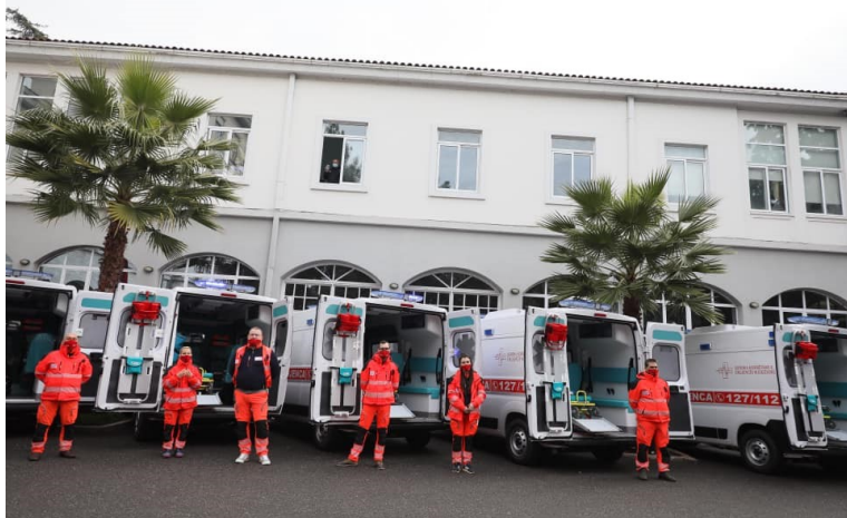
UNOPS handing over the vehicles to Albanian health authorities

As part of the COVID-19 emergency response project UNOPS delivered 20 Emergency Care Ambulances to Albania. The vehicles were handed over to the Ministry of Health and Social Protection and the National Centre for Medical Emergencies. The vehicles are fully equipped with all necessary equipment, including specific instruments for Covid-19 emergency patients. They will be used at regional hospitals across Albania and are expected to improve emergency care service for all citizens of these regions. More here