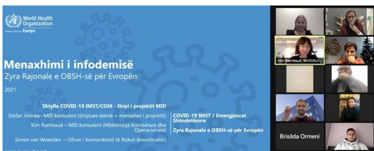
Infodemic Management training

The Covid-19 pandemic has been accompanied by a massive "infodemic". An infodemic, is an overabundance of information including false or misleading information in both digital and physical form. It causes confusion and risk-taking behaviors that can harm health. It also leads to mistrust in health authorities and undermines the public health response. An infodemic can intensify or lengthen outbreaks when people are unsure about what they need to do to protect their health and the health of the people around them.