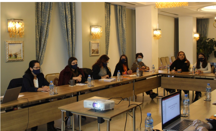
UNFPA Albania running consultations with key actors, from the health and social sectors.

UNFPA Albania run consultations with key actors, from the health and social sectors, to present the findings of the Minimum Initial Service Package (MISP) for SRH in Crisis Situations evaluation and to develop a workplan for 2022, where the focus is put on interventions to strengthen capacities and health structures to provide sexual and reproductive health services in times of emergency, including COVID - 19.