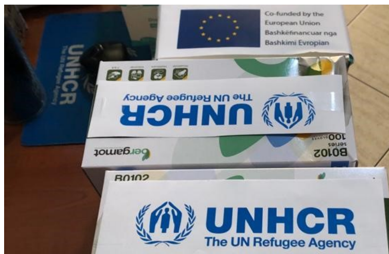
Packs with Personal Protection equipment delivered to Reception Centre in Babrru, Tirana.

During the reporting period, several persons of concern (PoCs) to UNHCR were affected by COVID-19. UNHCR, through its partner RMSA, continued to provide necessary support and guidance to the families infected by or showing symptoms of COVID-19. UNHCR facilitated vaccination of PoCs and ensured that all eligible (and willing) PoCs are vaccinated with two doses. UNHCR also continued to deliver PPE to PoCs and relevant personnel working with refugees, including the staff of Reception Centre for Asylum in Babrru, Tirana.