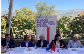
Event in Përmet with local agro-processing companies