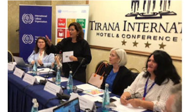
Presentation of Roadmap for the Textile sector