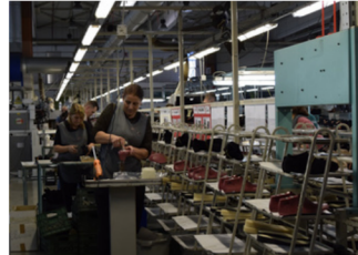
Textile company attending SCORE program