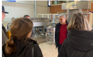
Consultation with agro-processing company