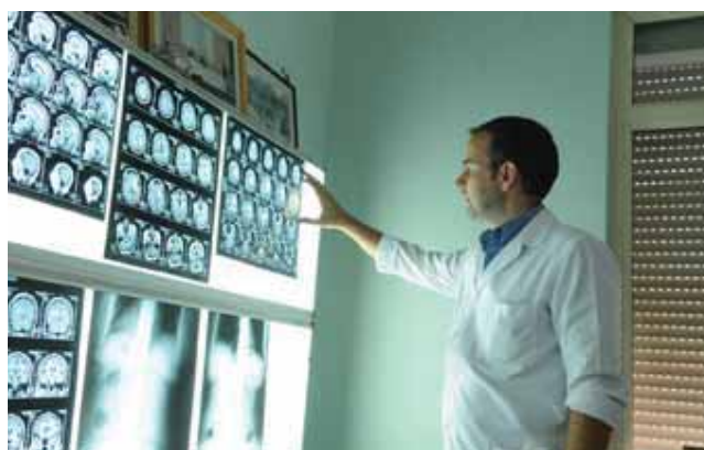
Health care centre

For Early Childhood Development (ECD), UNICEF supported GoA in modernising procedures for birth registration (including assisting Roma families with necessary paperwork and in courts), introduced comprehensive ECD training modules for professional caregivers, developed spatial-physical planning standards for nurseries (crèches) and produced a detailed costing analysis of services offered by crèches (including possible ways to optimise the existing system of day-care subsidies to better focus on the families most in need). UNICEF's support to 400 pre-primary classes, which correspond to about 25 percent of all basic education schools, was among the factors that contributed to an increase in pre-school enrolment among five–six year-olds, from 50 to 70 percent. Trainings in better parenting and medical check-