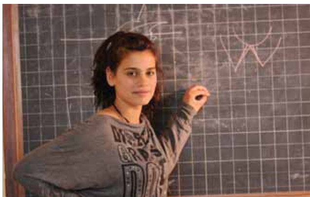
Education for all

In the area of basic education, UN-supported interventions are guided by the National Education Strategy 2004–2015, which links reform of the sector with improved governance in MoES and its regional branches, greater school autonomy and the establishment of accountability tracking mechanisms that would involve parents and communities. Decentralisation shifts initiated in the mid-2000s transferred many operational tasks to the Regional Education Directorates (REDs), municipal and communal authorities and school administrations, but adequate re-distribution of managerial and technical capacities lagged behind.