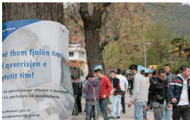
Introducing ICT at local level

The UN continued to support the implementation of the Paris Declaration in 2011 by contributing to the preparation of an Organisation for Economic Co-operation and Development – Development Assistance Committee (OECD–DAC) survey and of its Gender Equality Optional Module. In support of the implementation of the Paris Declaration principles, UN Women enabled the participation of representatives of the Government and civil society to the fourth High Level Forum on Aid Effectiveness in Busan.