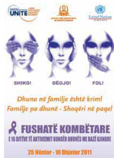
Poster produced for Violence Against Women campaign

In June 2011, GoA, with UNDP support, opened the first national shelter for survivors of domestic violence. This represents a considerable investment, in terms of infrastructure work and purchase of equipment and furniture, but, more importantly, also as a solid legal and institutional framework in which the shelter will operate. To this end, UNDP provided technical assistance for: i) MoLSAEO to develop a