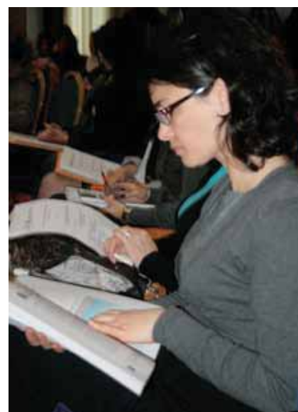
Conference on Census, Tirana

During the first half of 2011, United Nations Population Fund (UNFPA) support was provided in collaboration with UN Women and United Nations Fund for Children (UNICEF) with a focus on developing national capacities to advance data analysis. A dynamic programme of training and technical assistance was provided to around twenty researchers from INSTAT, Institute of Public Health (IPH), academic institutions and Non-Governmental Organisations (NGOs). Researchers were trained in advanced statistical techniques, analysis and interpretation of results and drafting papers for publication. Technical guidance was also