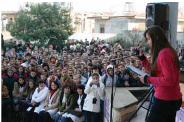
Gender equality campaign in school, Tirana

In the context of revision of the Justice Strategy, UN Women provided technical support to include gender equality obligations in this strategy for the first time. With UNDP support, and based on successful local