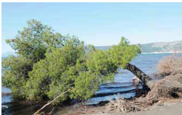
Climate change impact, Lezhe

Within the framework of the first climate change project in the region—Identification and implementation of adaptation measures in the Drin–Mat area—UNDP supported Lezha Regional Council to integrate climate change and adaptation into development of new sectorial strategies, including tourism, agro-tourism and forestry. In addition, UNDP supported new development plans for three communes in the locality. As a follow up to regional and communal adaptation plans, a GIS map of the communes' adaptation measures was prepared, supported by the economic estimates of the adaptation measures based upon a vulnerability and risk assessment analysis of the area. Ministry of Environment, Forests and Water Administration (MoEFWA) was supported by UNDP to include climate change adaptation in the management plans of protected areas. An Integrated Monitoring System was established with UN support. As a conceptual framework, the system includes a detailed set of indicators to be monitored in order to understand ecosystem responses to climate change and the effectiveness of the adaptation measures.