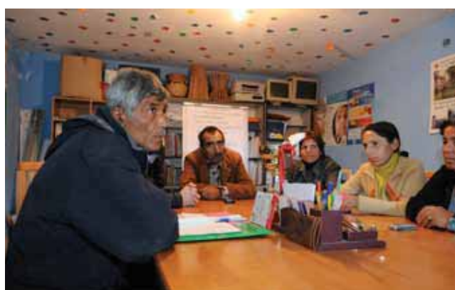
Roma Community members identifying their development priorities, Elbasan

In late 2011, an evaluation of the Social Inclusion Strategy (2007-2013) was initiated with UNICEF support. The Social Inclusion Strategy comprises measures related to social protection, health, education, employment, justice, water supply and transport specific policies. The review of this strategy will focus on the effectiveness of the social inclusion framework to capture progress by a variety of stakeholders in specific areas, and will assess the coordination and monitoring capacity of MoLSAEO, including in the area of data management systems.