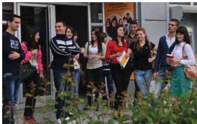
University students, Tirana

UNICEF continued to support Youth Parliaments at national and local levels to increase the access of youth to information and capacities to participate effectively in public decision making. Youth Parliaments were strengthened to act as a strong advocacy youth network, addressing youth concerns, by putting human rights and gender issues high on the public agenda. Youth Parliaments are now active members in the twelve regions, where they facilitate the creation of specific bodies or committees composed of representatives of youth and local authorities, enabling young people to express their opinions and have a say in public decision making. As examples, the Youth Parliament in Durres succeeded in introducing a specific budget line for youth activities, in Lezha, the Youth Parliament strongly advocated environmental issues, and in Shkodra, young people are collaborating with the Employment Services to ensure that youths more in need are reached, while in Gjirokastra, it has facilitated cross-border interaction with youth in Greece.