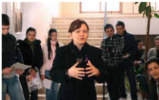
Raising awareness among youth on gender based violence, Tirana

UN Women promoted the effective use of media and communication tools by NGOs to strengthen their capacity to promote women's leadership, women's rights and gender equality. As a result, NPOs organised (i) national and local talk shows where scorecards, quota, family voting and women participation in decision making were discussed, (ii) local and national press conferences to launch the results of the community-based scorecards, and (iii) a national press conference to request implementation of the quota by political parties. Moreover, with UN Women support, a network of NPOs signed a framework of cooperation with the Union of