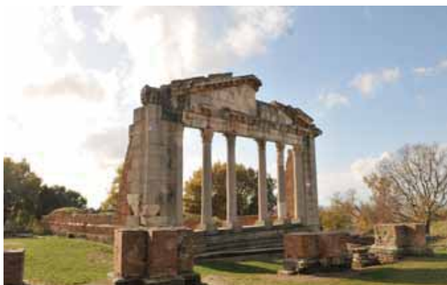
Apollonia archaeological site

With United Nations Educational, Scientific and Cultural Organization (UNESCO) and UNDP support, and financed through the Spanish MDG Achievement Fund, rehabilitation of the ethnography pavilion at the National History Museum (NHM) and the works for reopening the Apollonia archaeological museum were completed, while those for renovation of the NHM conference room continued to progress. Visitor information tools produced for the archaeological site of Antigonea and for the city of Berat have improved the visitor's experience. Meanwhile, the artisan incubator in Gjirokastra continues to operate. Visitor information quality has improved with completion of a cultural heritage signage project in the historic centre of Gjirokastra and the opening of a new tourism