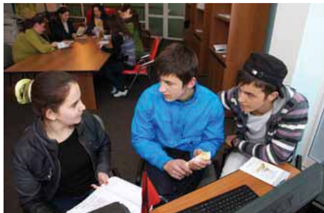
Youth Employment Services centre, Shkoder

services, initially planned in two regions, are delivered in five as part of the regional employment offices. They provide youth with information and counselling services on employment. Direct youth employment services were provided to 640 youth in two regions. Orientation and career development sessions were organised involving 3,600 young people in secondary schools over the project life cycle. 240 youth received livelihood and life skills extensive courses. Moreover, orientation and career development sessions were organised involving around 400 young people in secondary schools.