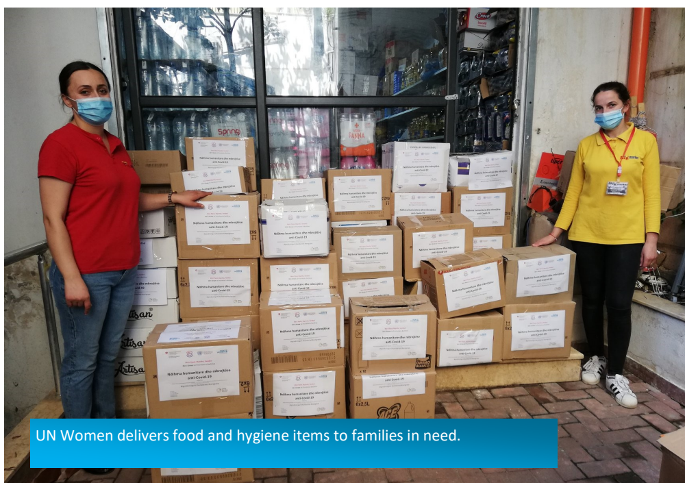
UN Women delivers food and hygiene items to families in need.

(Supported by SDG Joint Fund, LNB funded by Swiss Government, and EVAW supported by Government of Sweden)