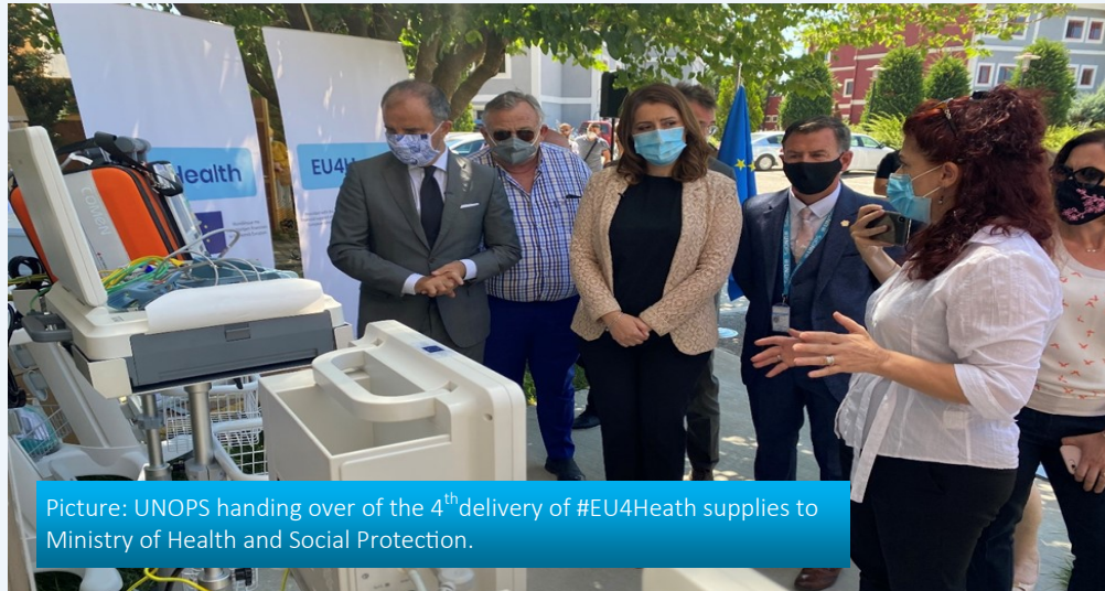
Picture: UNOPS handing over of the 4 th delivery of #EU4Health supplies to Ministry of Health and Social Protection.

Thanks to funding from our development partners including the EU, USAID, Sweden, Switzerland and Norway, the UN Agencies in Albania continue to provide support for in Albania in securing the necessary supplies for Covid-19