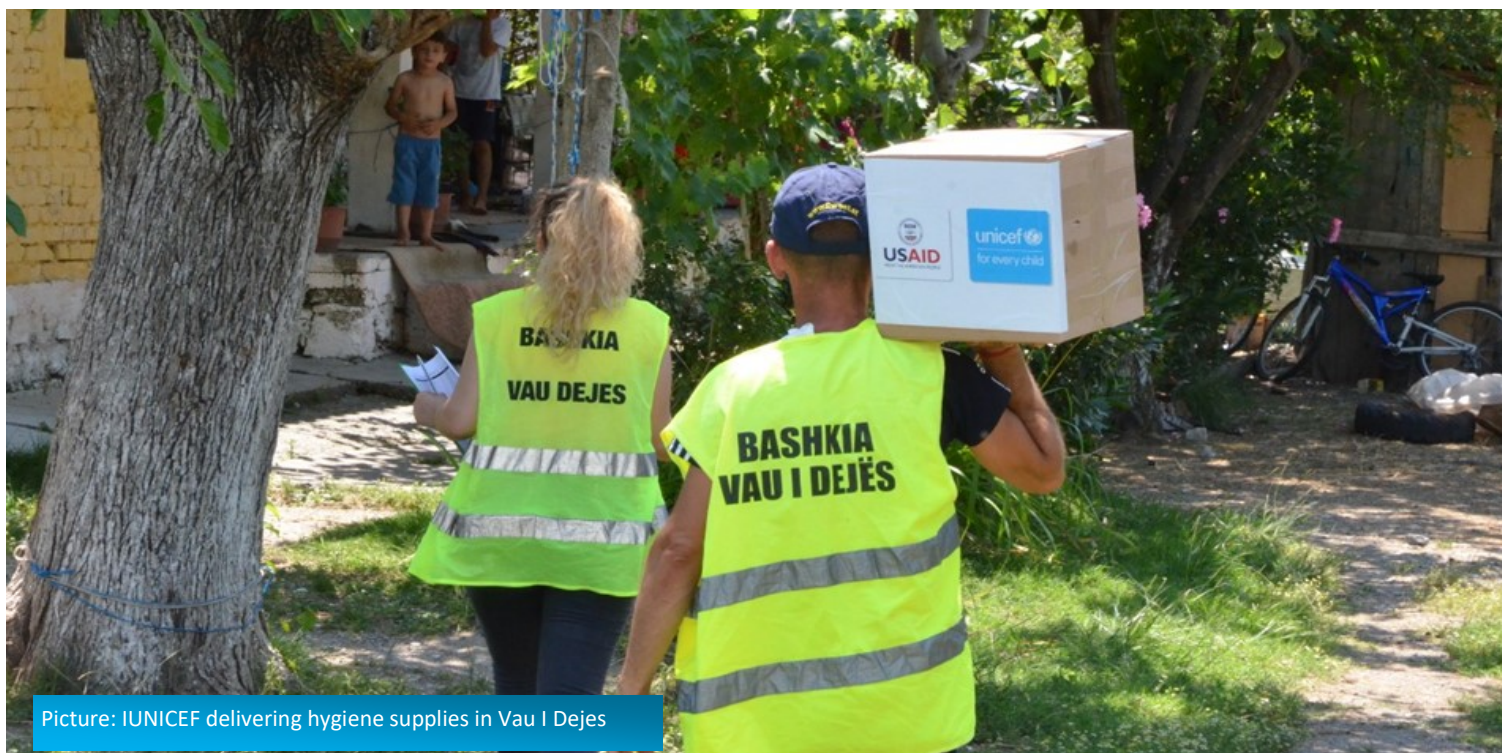
Picture: IUNICEF delivering hygiene supplies in Vau I Dejes

UNICEF delivered critical personal and family hygiene supplies to 11,562 children and 15,876 adults in municipalities of Tirana, Fier, Vlore, Shkoder, Korce, Kukes, Elbasan, Lezhe, Pogradec, Vau i Dejes, Berat, Maliq, Durres following a partnership with local governments to identify and help vulnerable families and children in need of emergency support. 2000 additional hygiene kits, containing cleaning and disinfection supplies were distributed to 400 creches and kindergartens benefiting around 18,200 children.