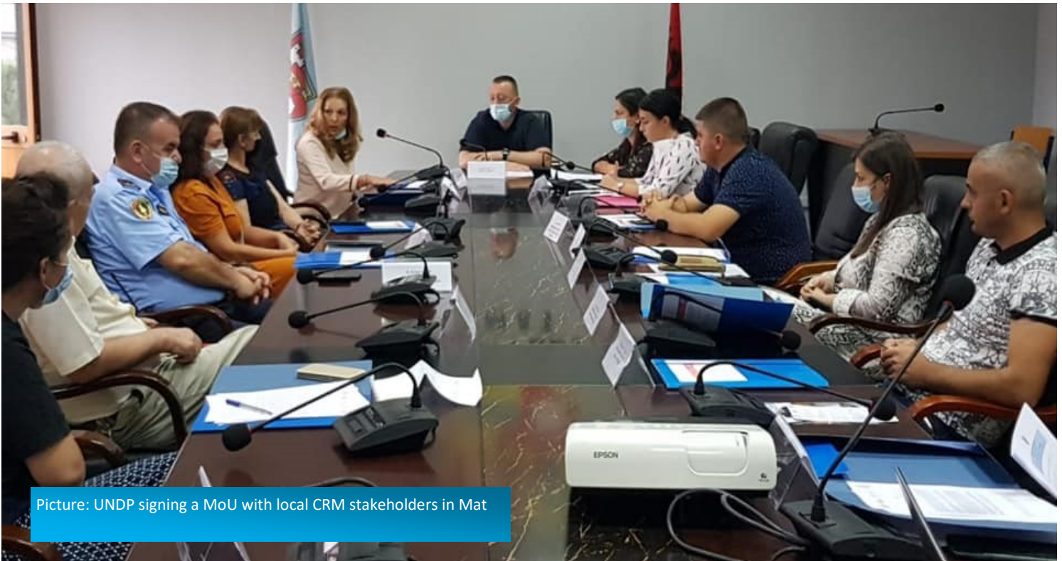
Picture: UNDP signing a MoU with local CRM stakeholders in Mat

Under the UN Joint Programme “Ending Violence Against Women in Albania” (EVAWIA) funded by Sweden, UNDP worked through multi-sectorial technical teams of Coordinated Referral Mechanisms in 15 municipalities to ensure coordination of efforts from all involved stakeholders to prevent and handle domestic violence cases at local communities, especially in the context of the COVID-19 situation.